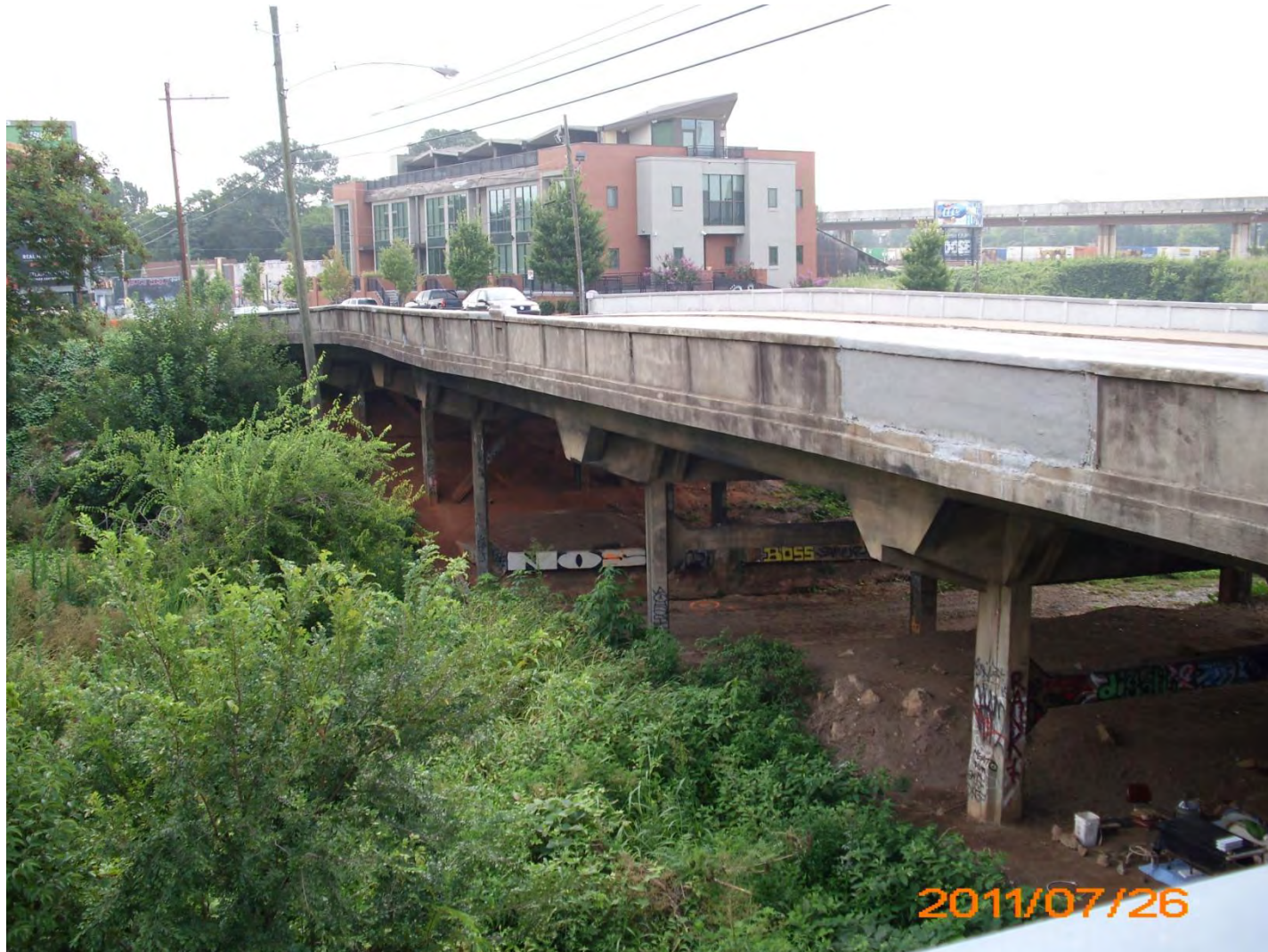
Edgewood Ave Bridge