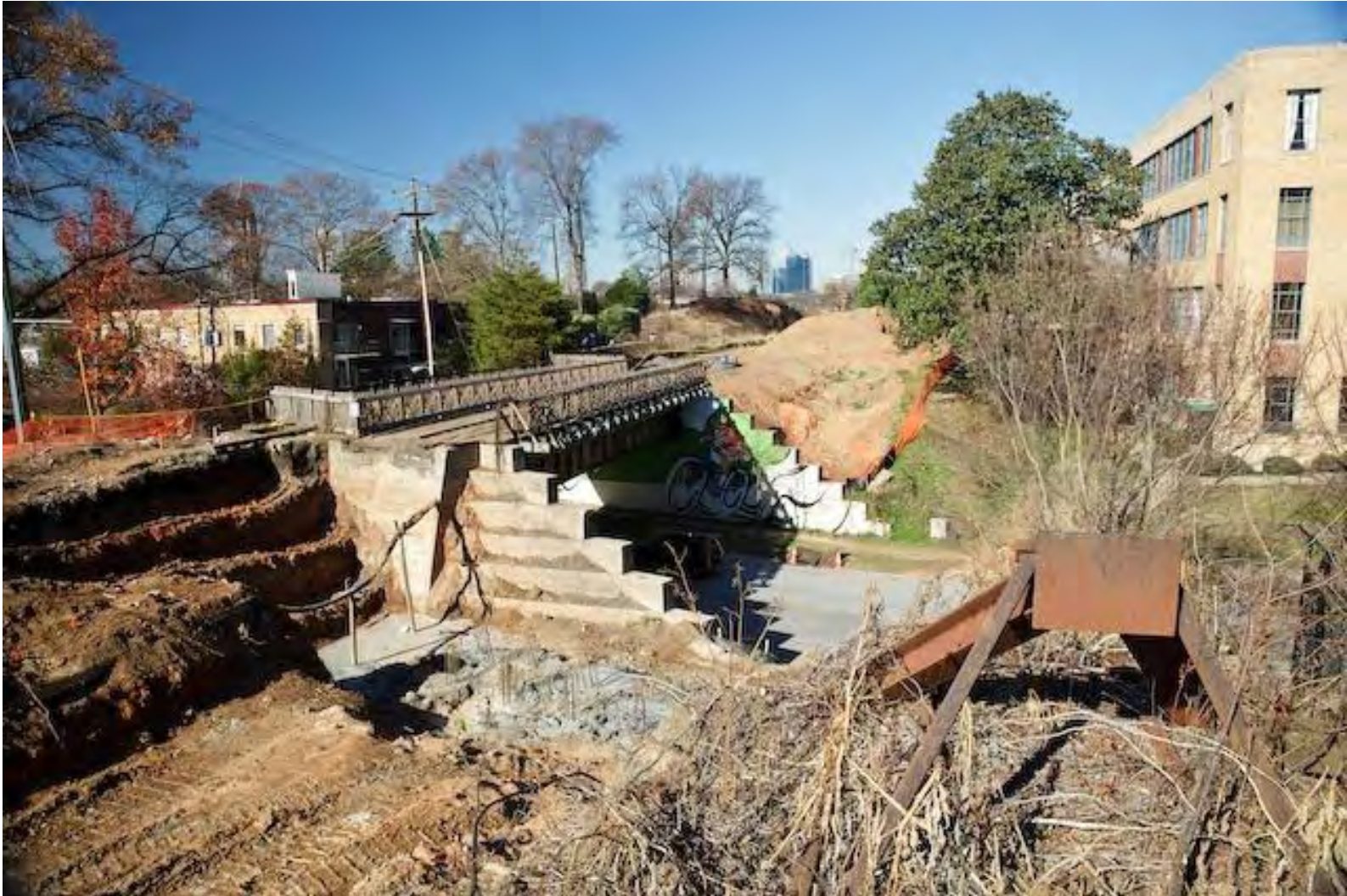
Ralph McGill Bridge