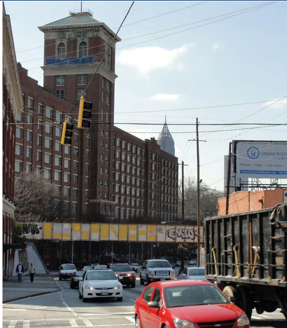
Ponce de Leon Ave Bridge