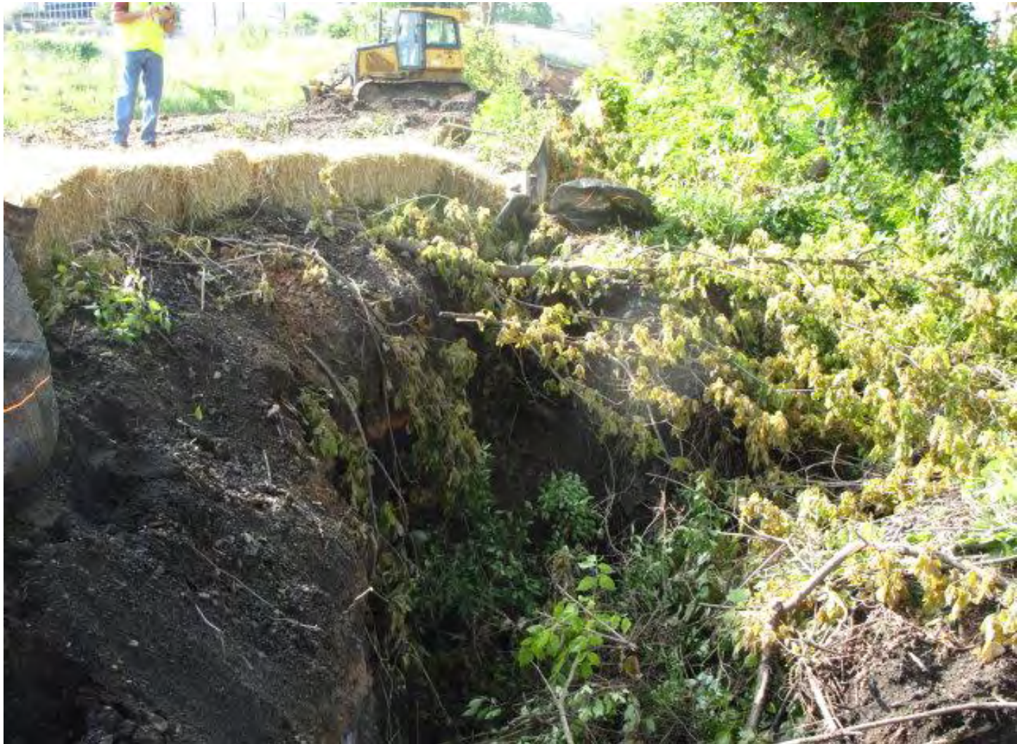
Midtown Promenade Slope