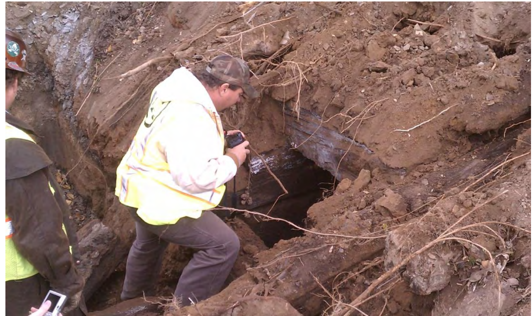
Grinnell Lofts and North of Greenwood